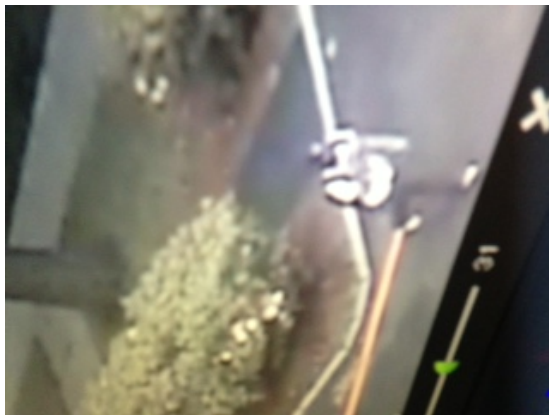
Person of Interest